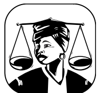
National Prosecuting Authority South Africa

Tel: +27 12 845 6000 | Victoria & Griffiths Mxenge Building, 123 Westlake Avenue, Weavind Park, Silverton, Pretoria P/Bag x752, Pretoria, 0001, South Africa